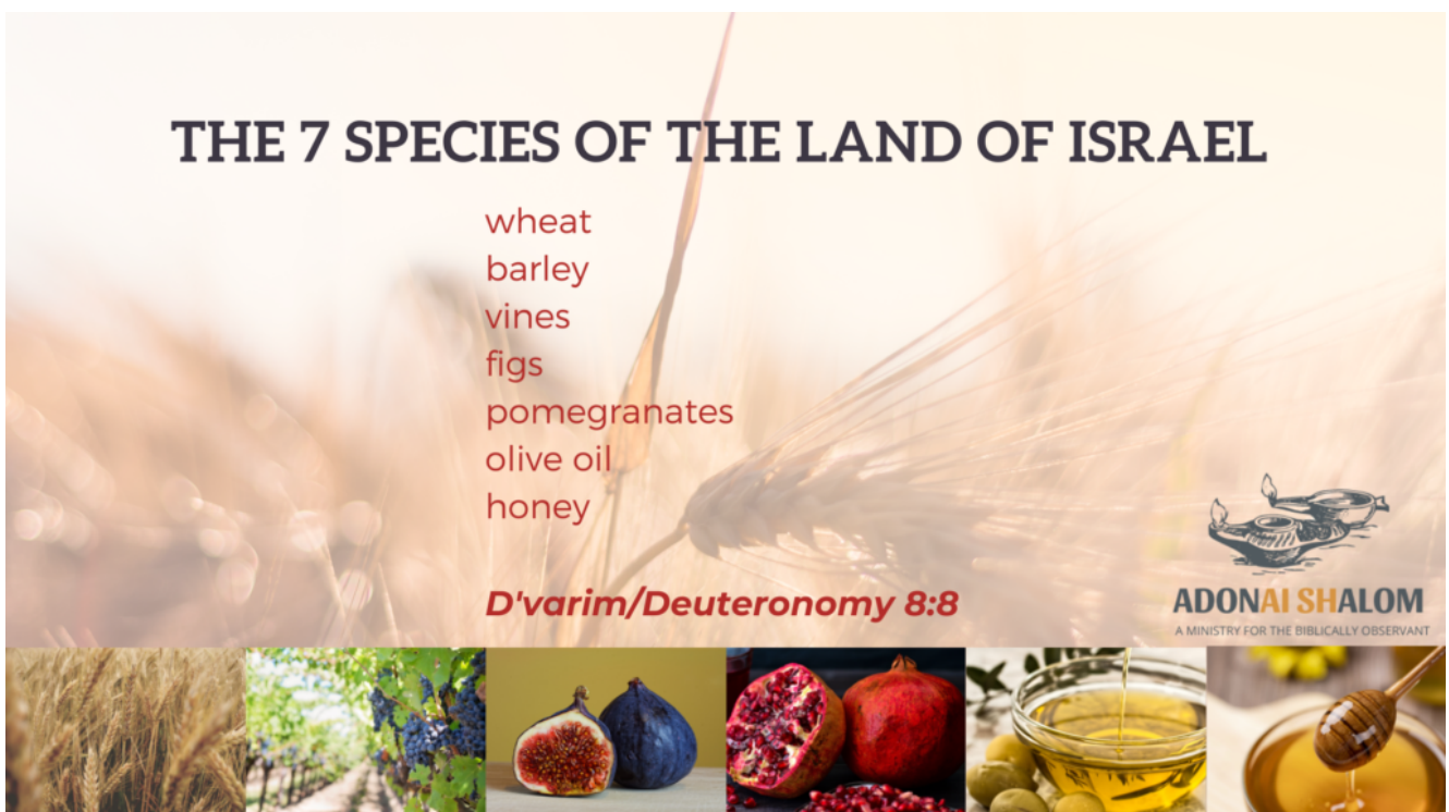
The Seven Species of the Land of Israel