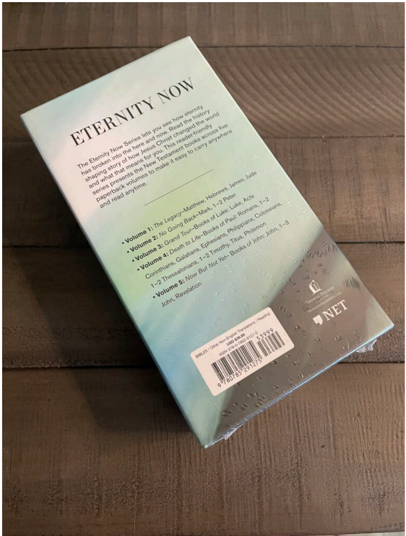
Eternity Now back cover

Scripture. It is reader-friendly, eye-catching, and somewhat unconventional.