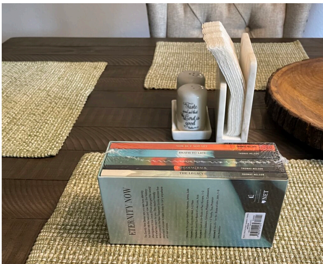
“Eternity Now: The New Testament Series” New English

The “Eternity Now” series is a compilation of all of the books of the New Testament/ B’rit Chadashah arranged in a manner making it read more like a novel. This book set would be a wonderful gift idea for a young person in your life who might not otherwise read the Bible.