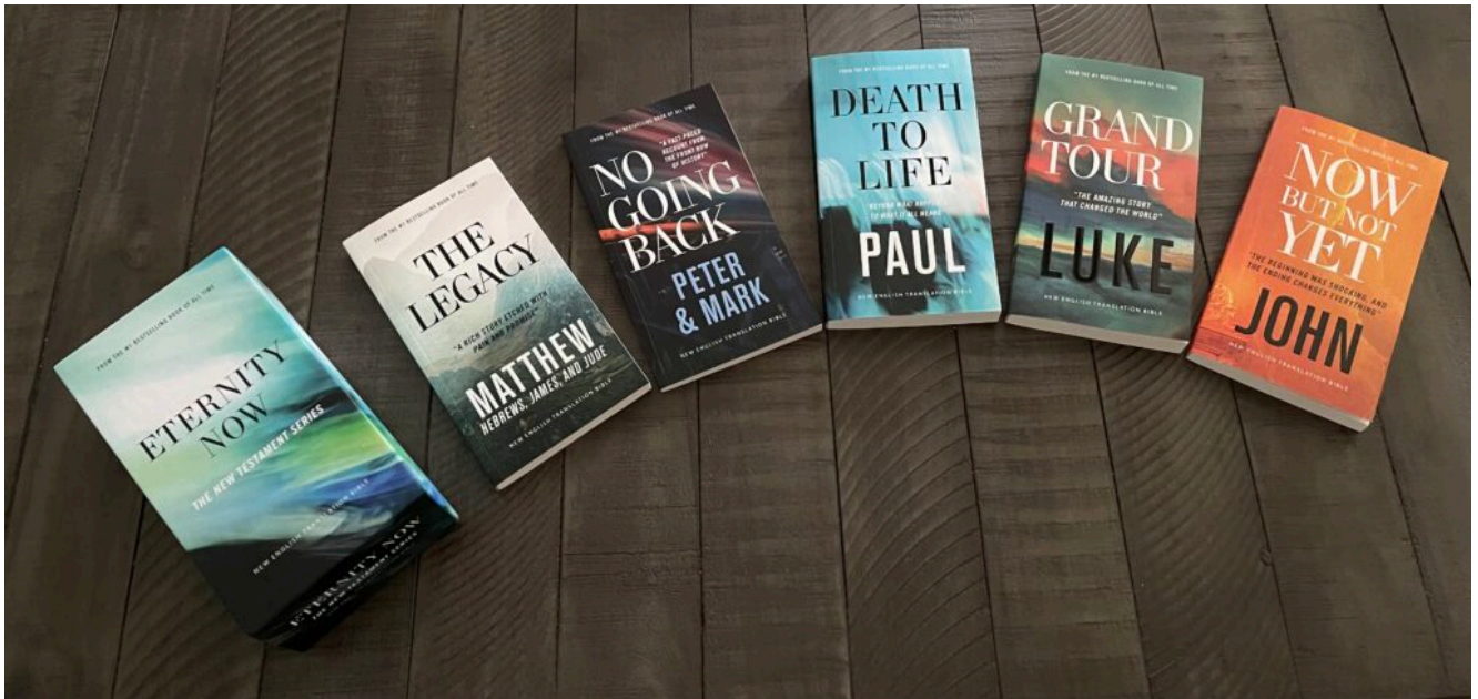
“Eternity Now: The New Testament Series” set of 5 books