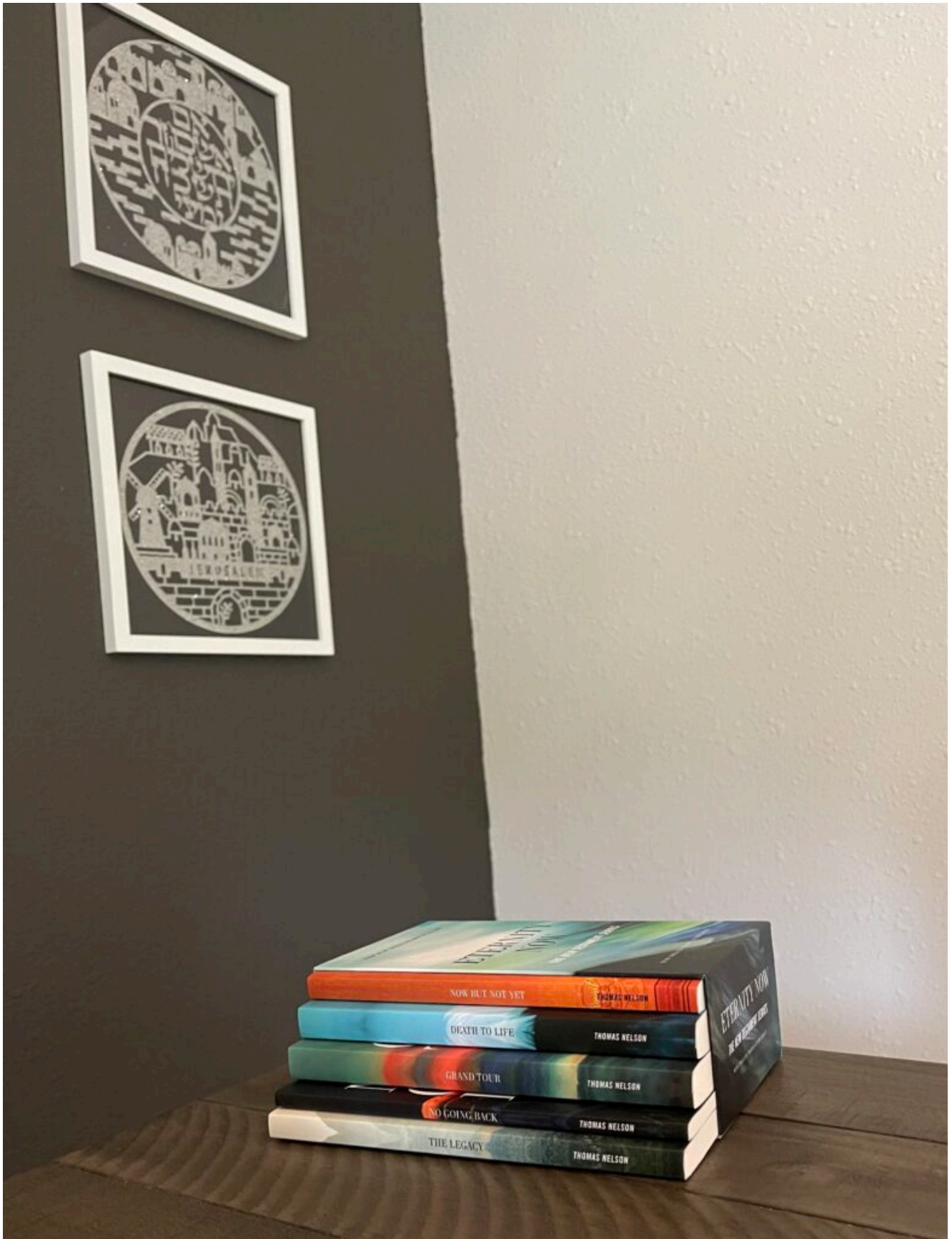
“Eternity Now: The New Testament Series (NET)” New English Translation