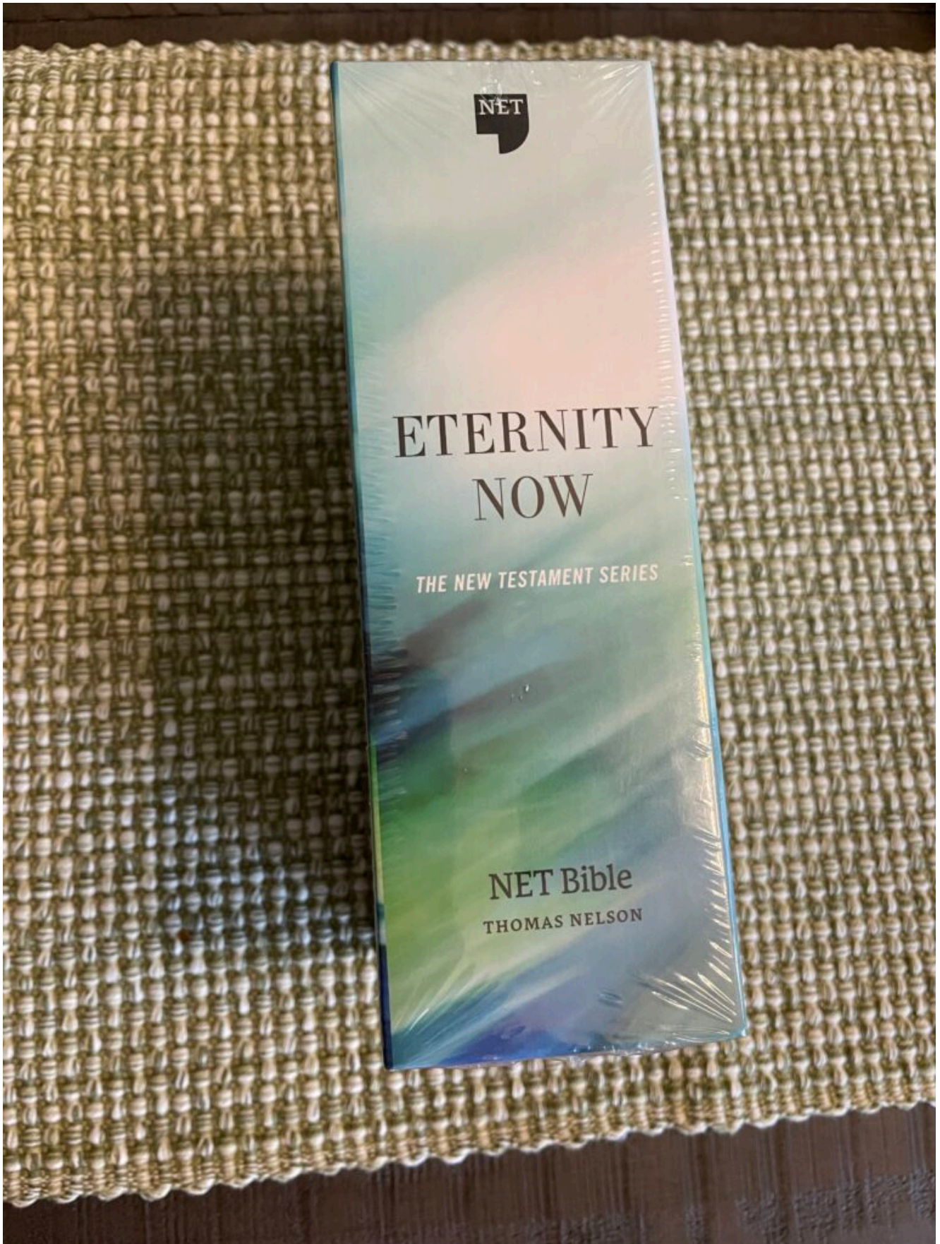
Eternity Now spine

The paperback format makes these books easy to carry. Someone sitting beside another on the metro will not immediately recognize that the person with one of these books is reading