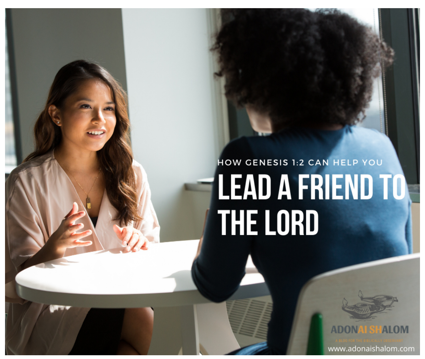
Genesis 1:2 can help you lead a friend to the LORD (and away from cult doctrines!)

In order to properly witness to a member of a cult religion, we must ourselves be confident in Whom we have believed and know the Truth of Scripture for ourselves.